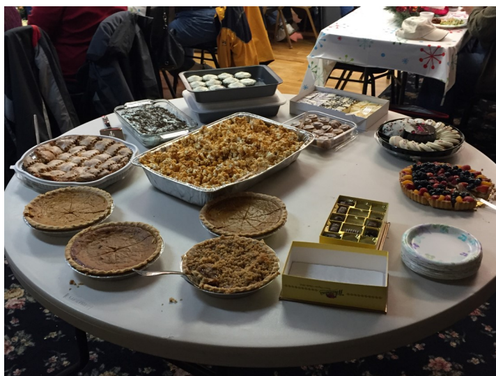
The dessert table prior to the arrival of the demolition crew.